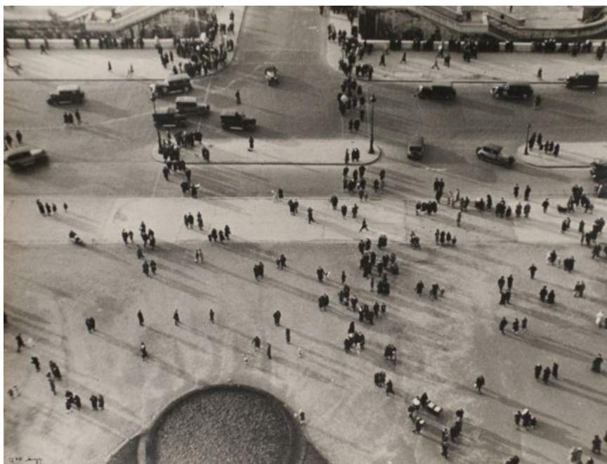
Ilse Bing: Champ de Mars, 1931, at Bruce Silverstein Gallery, New York City